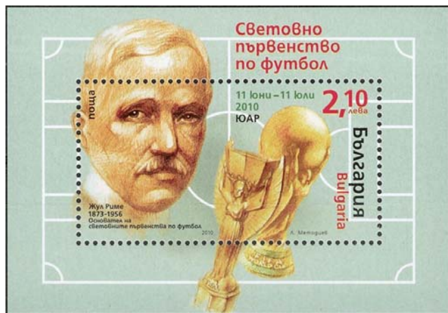
The Jules Rimet Cup, shown in the foreground of this souvenir sheet from Bulgaria, features the Winged Victory (Nike). The Cup was awarded to the victors of the World Cup from 1930 to 1970.