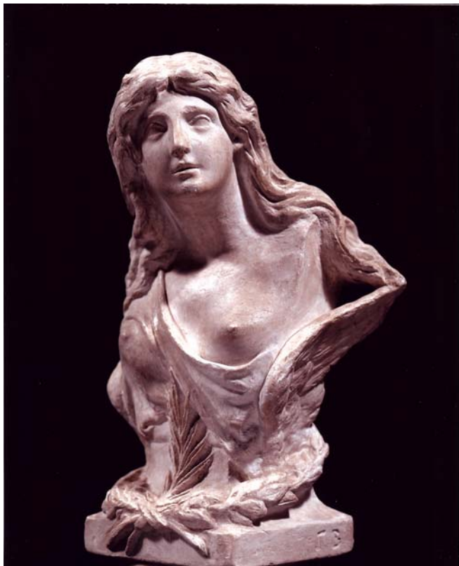
The Winged Victory plaster statue awarded to each foreign first place winner at the 1896 Athens Olympics.